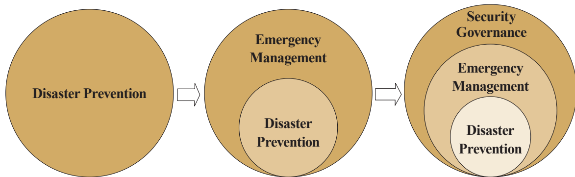
Figure. 2 Relationships between generations of China's emergency management practices

wisdom of Chinese traditional culture and insights gained in contemporary practices based on learning from and drawing on western theories, and carry out corresponding theoretical transformations and generalizations to enhance the autonomy